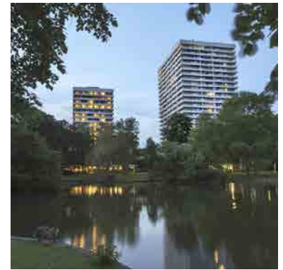
Maritim Hotel Gelsenkirchen Am Stadtgarten 1 45879 Gelsenkirchen, Germany

Phone: +49 (0) 209 176 2040 Fax: +49 (0) 209 176 2091 reservierung.sge@maritim.de www.maritim.com