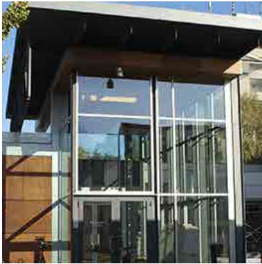
Bildungshotel BfZ Essen Blücherstrasse 1 45141 Essen, Germany

Phone: +49 201 3204243 Fax: +49 201 3204277 bildungshotel@bfz-essen.de www.bildungshotel-essen.de