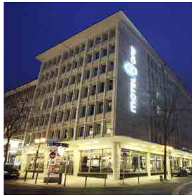
Motel One Essen Kennedyplatz 3 45127 Essen, Germany

Phone: +49 201 437 537-0 Fax: +49 201 437 537-10 essen@motel-one.com www.motel-one.com