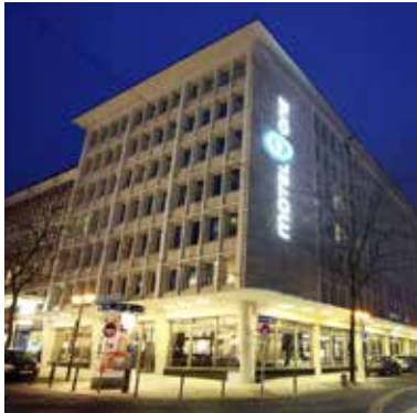
Motel One Essen Kennedyplatz 3 45127 Essen, Germany

Phone: +49 201 437 537-0 Fax: +49 201 437 537-10 essen@motel-one.com www.motel-one.com