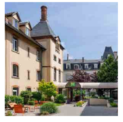
ibis Styles Colmar Centre ***

11 Boulevard du Champ de Mars 68000 COLMAR FRANCE Phone: +33 3 89 23 26 25