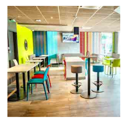
ibis budget Colmar Centre-Ville **

To facilitate your decision, we recommend the following hotels: