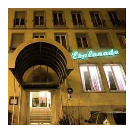
Hotel Esplanade Strasbourg 1, Boulevard Leblois, 67000 Strasbourg France

Phone: +33 3 88 61 38 95 info@hotel-esplanade.fr www.ihotel-esplanade.fr