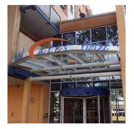
Ates Hotel Straßburg-Kehl Straßburger Straße 18, 77694 Kehl am Rhein Germany

Phone: +49 7851 88565-0 info@ates-hotel.de www.ates-hotel.de